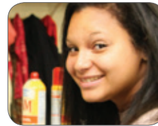
River Valley Life Center Page 3